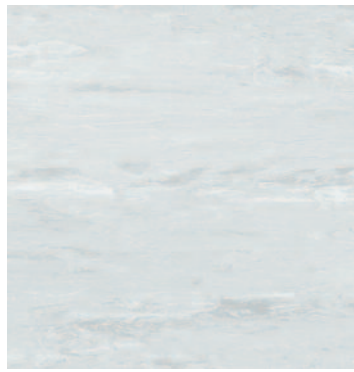
Pumice 3700* w/r 2650