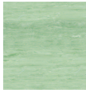
Connemara Green 3800 w/r 3800