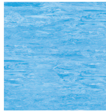
Crystal Blue 3740* w/r 3740