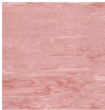
Sedona Pink 3860 w/r 9060