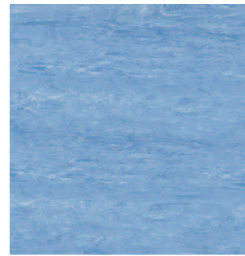
Azure 3770 w/r 3770