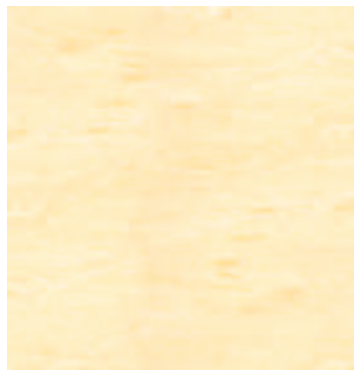
Opal 3920 w/r 2670