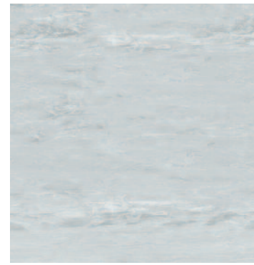
Fossil 3710* w/r 3710