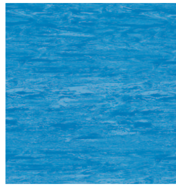
Tanzanite Blue 3750 w/r 3750