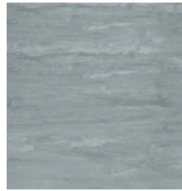
Flint 3720* w/r 3720