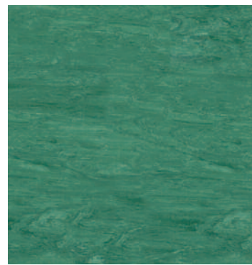
Jade 3830 w/r 2520