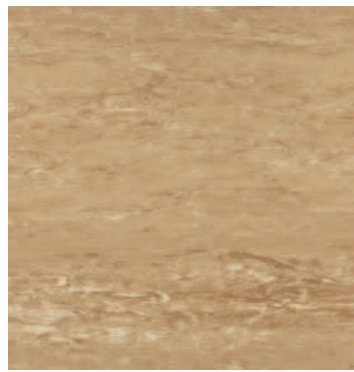
Sablee Beige 3900* w/r 2510