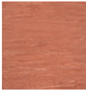
Ironstone 3850 w/r 3850