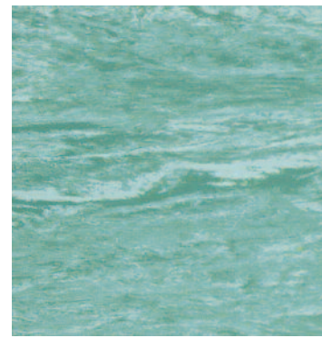
Turquoise 3810* w/r 2610