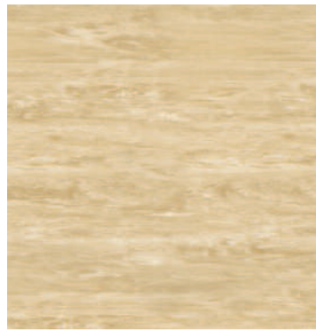
Dolomite 3910* w/r 2500