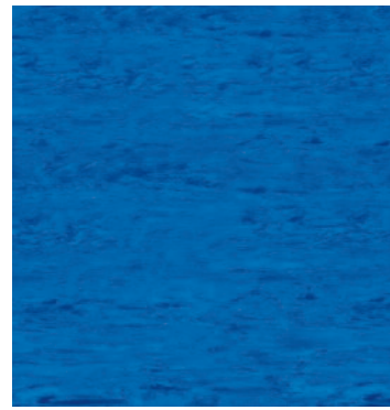
Blue Zircon 3760* w/r 8440