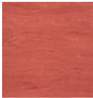
Ruby 3840 w/r 2560