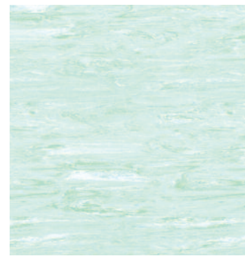
Peridot Green 3790 w/r 3790