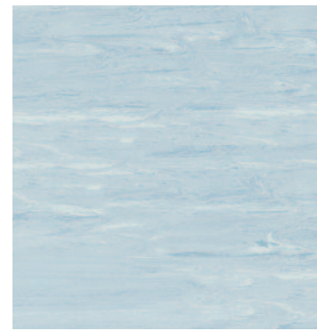
Blue Nickel 3730 w/r 5350