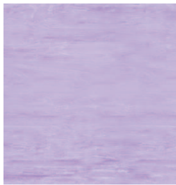
Amethyst 3780 w/r 3780