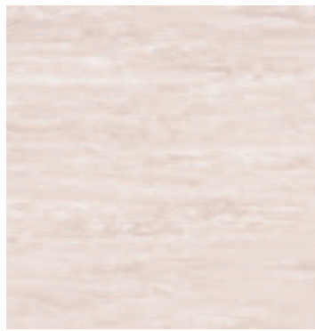
Rose Quartz 3870* w/r 3870